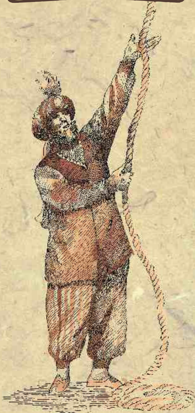
The Great Indian Rope Trick